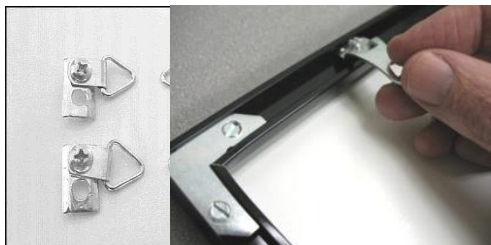
Metal Frame Hangers