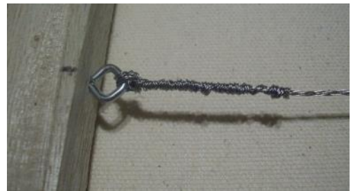
Screw Eyes with Braided Picture Hanging Wire