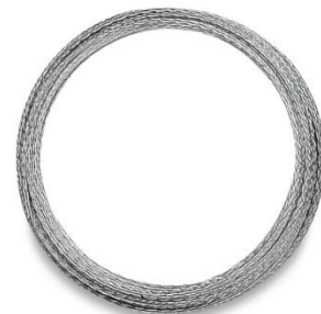
Hangers with Braided Picture Hanging Wire